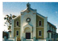
Holy Rosary 284 Anzac Ave Marian