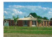
Immaculate Conception 44 Victoria St Mirani