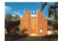
St Francis de Sales 8 Zahmel St Finch Hatton