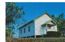
Immaculate Heart of Mary Mt Ossa Road Mt Charlton