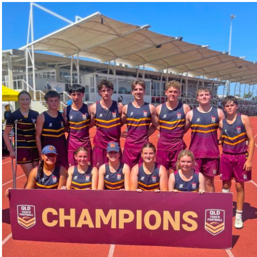
Congratulations to Marist College, Emerald who were the successful 2024 Queensland All Schools Touch Under 18 Mixed Champions.