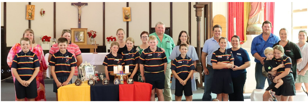
Pictured above are Year 6 School Leaders at St Joseph's Catholic Primary School, Blackall , and their families at the Junior Joeys Leadership Induction ceremony. Leaders promised to create a great learning environment by becoming living examples of the school's five virtues: Respect, Responsibility, Service, Integrity and Relationship with God.