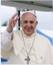
Reflection from Pope Francis