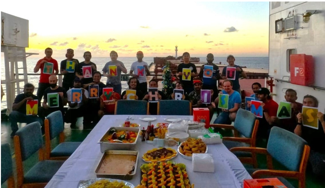
The school community at St Anne's Catholic Primary School, Sarina , received a special photo (above) and message from seafarers thanking them for the Christmas gift boxes the crew members received while docked near Hay Point over the holidays. The boxes were collected as part of the school's Giving Mass prior to the Christmas holidays, and were provided to Stella Maris for distribution to the ships around Hay Point for crew members who were away from home and family over Christmas.