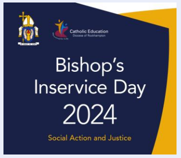
Friday 16 February

We are always very grateful for any Good News stories from our Kindergartens, Primary Schools and Colleges that we can share via the Message Stick. Please send content and photos to media@rok.catholic.edu.au no later than Tuesday COB each week of term.