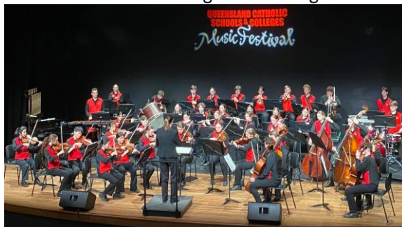
Chanel College Gladstone