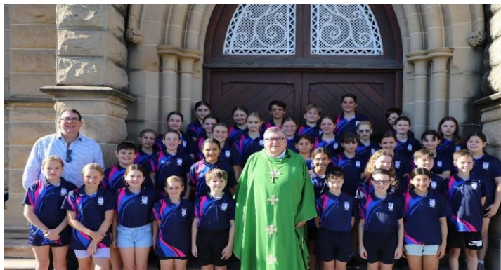
Book Week at MacKillop Catholic Primary School, Mackay