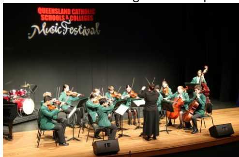
Marist College Emerald