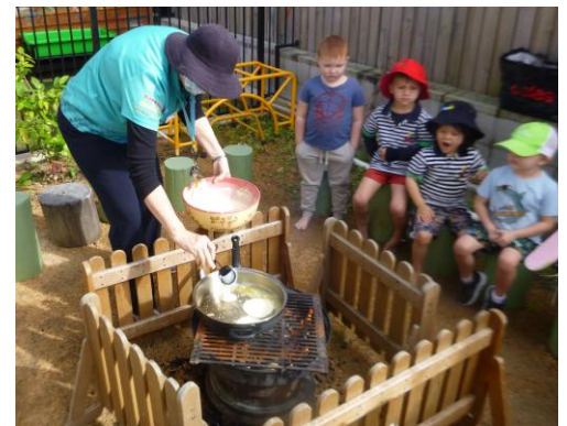
Campfire fun at St Joseph's Catholic Kindergarten, Bundaberg.