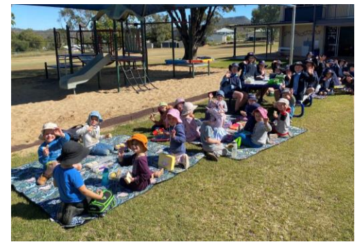
Enjoying lunch on the lawn together in Springsure are students from Our Lady of the Sacred Heart Catholic Primary School and Kindergarten.