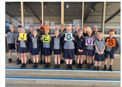
Students take part in Battle of the Hymns at St Joseph's Catholic Primary School, Wandal.