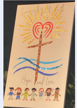
Display prepared by St Benedict's Catholic Primary School, Yeppoon

Catholic Education Week • 24-30 July 2022