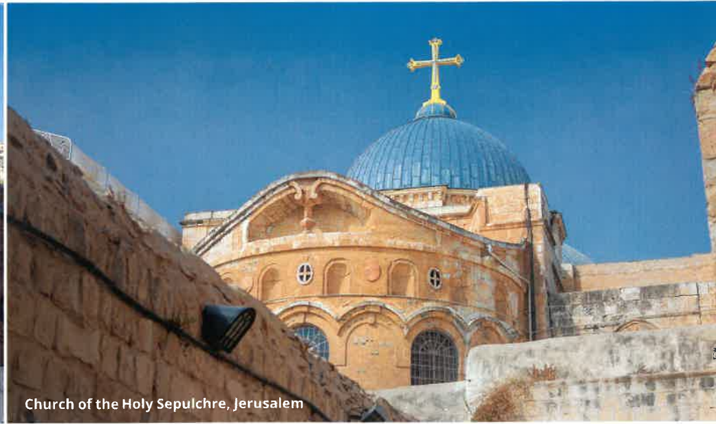
Church of the Holy Sepulchre, Jerusalem

Meal Code (B) = Breakfast (L) = Lunch (D) = Dinner